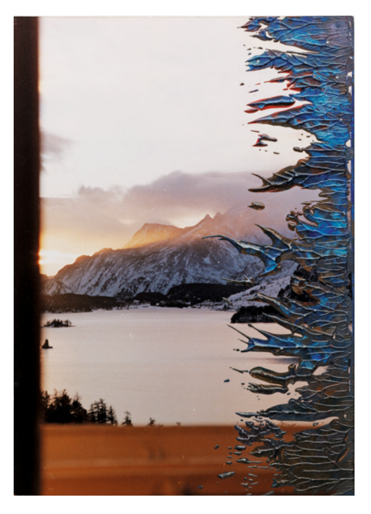
19.4.07, 2007, oil on photograph, 16.9 × 12.5 cm. Private collection, Germany