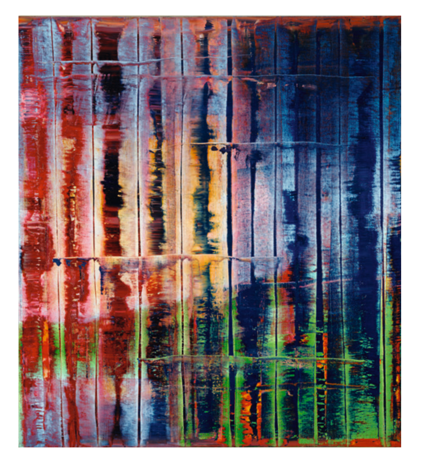
Abstract Painting, 1992, oil on canvas, 200 × 180 cm, private collection