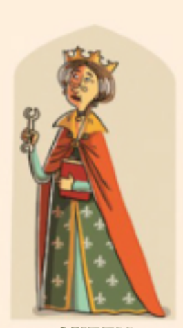
QUEEN DROGOMIRA She's a builder and ar

Navoya is unruly and nosy. She dreams of having her own pet and experiencing a big adventure.