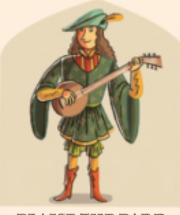
BLAISE THE BARD

The dragon lives in the vaults of the castle and keeps itself hidden from the adults.