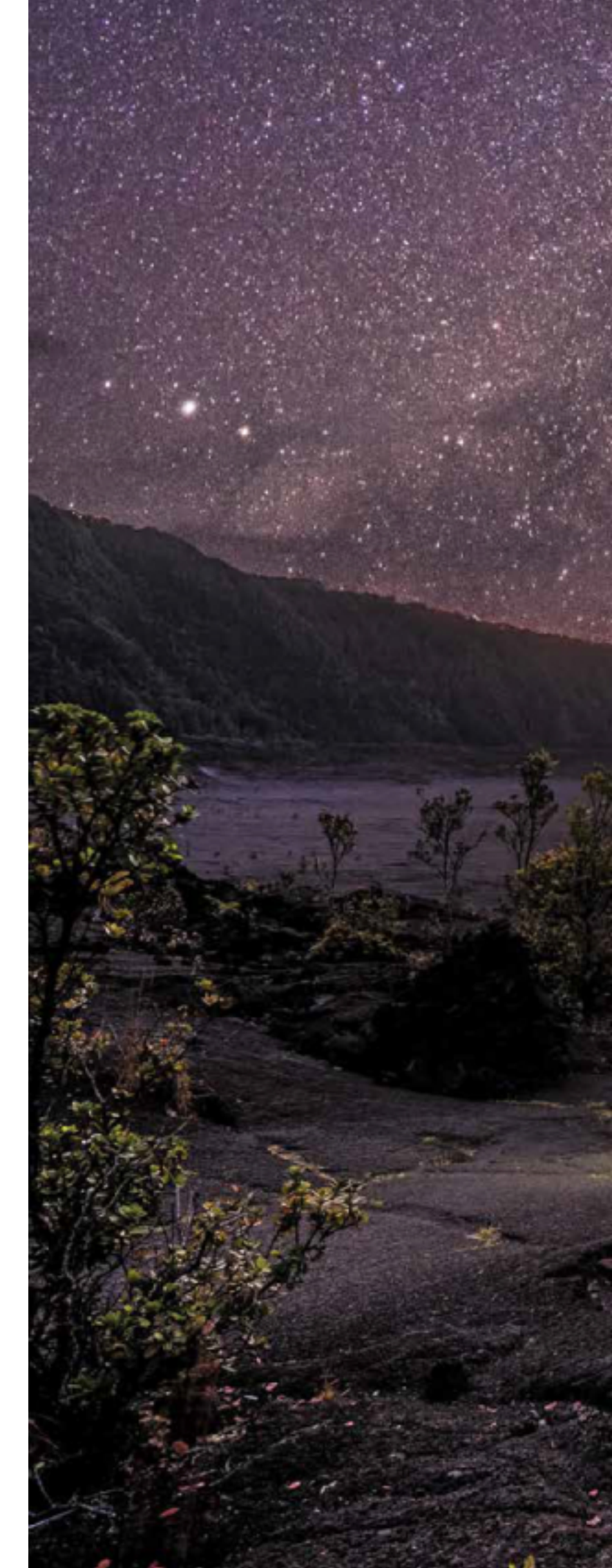
Stargazing in Hawai'i, one of the most popular destinations on my site.

I'm lucky that I met the love of my life at a campfire in Namibia and that we are starting a family. I know for sure that we will share our love of travel and adventures with our children, and I'll always feel glad that I took a leap of faith. I love the adventures that I get to have by myself, even though they're not so frequent these days, and that's totally fine with me. If the past 10 years have taught me anything, it's that it's never too late to take a leap of faith, and that there's almost always something better on the other side.