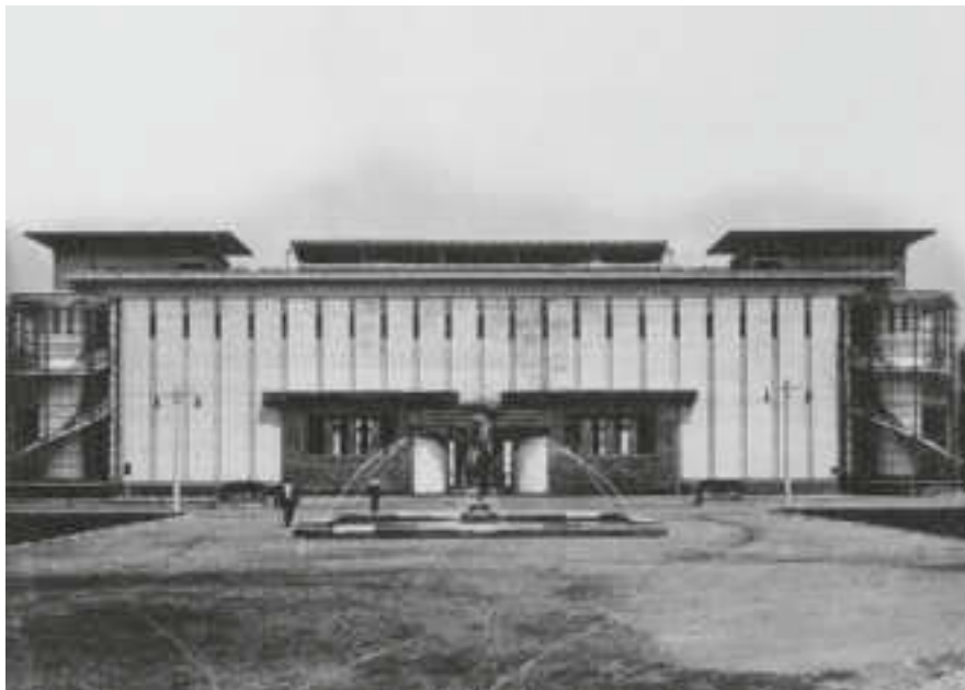
The office building for the pattern factory designed by Walter Gropius and his partner Adolf Meyer, with side stairwells entirely of glass, at the Deutscher Werkbund exhibition in Cologne, 1914.

wards, together with his colleague Adolf Meyer, he designed a new factory building for the Fagus shoe-last factory at Alfeld, near Hanover. Here, turning away from the reiteration of historical styles, Gropius created something truly new, for the glass exterior walls of the factory were largely freed from their load-bearing and supporting function. A revolutionary glass façade of this kind was later to become a significant characteristic of the Bauhaus building in Dessau. Also in 1910, Gropius became a member of the Deutscher Werkbund (German Work Federation, an association of artists, designers, architects, and industrialists) and, as a committed young comrade-in-arms, he worked on its yearbooks. When, at the Werkbund exhibition in Cologne in 1914, a scandal broke out—the so-called “Werkbund dispute”—Gropius took sides with the established figure van de Velde. The cause of the dispute was a controversy between van de Velde and the architect Hermann Muthesius that nearly caused the breakup of the Werkbund. While Muthesius spoke out in favor of standardization in architecture and the industrial production of furniture