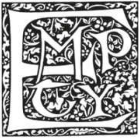
Gothic overtones: “Empty,” designed in 1896 by William Morris for a book illustration.

→ The Multitalented William Morris , a follower of Ruskin, for whom the arts—as for Ruskin—are based on the crafts. Morris, a socialist, wanted to create “from the people for the people.” The Arts and Crafts Movement, which he founded, strongly influenced the reforms in the crafts in the Art Nouveau period (known as Jugendstil period in Germany).