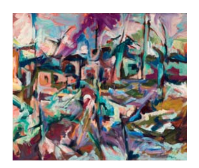
Mill Forms—Eagle Square, 1958 Oil on canvas