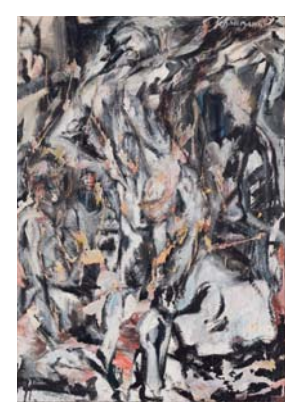
Three Figures after Pontormo, 1957 Oil on canvas