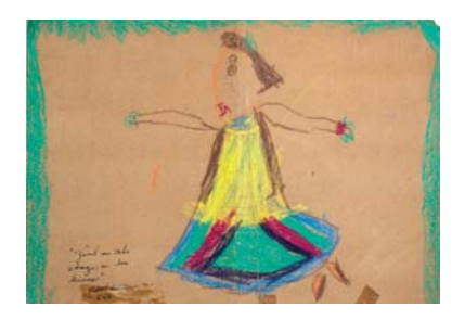
Girl on the stage, on her knees, 1940s Childhood drawing Pencil, pen, and crayon on paper

In the following pages, I will try to outline the development of Carolee Schneemann's art, highlighting her employment of different media, disciplines, and genres, from her early portraits and landscapes through her assemblages and the use of fire as a painterly material to her groundbreaking performances, experimental films, and large-scale installations in which electronic media play a prominent part. Art historians have primarily taken note of Schneemann as a pioneer of performance art and in the 1960s, as an assertive woman artist addressing issues of (female) sexuality and lust in provocative works which inevitably courted controversy. Schneemann's vital contributions to the establishment of a feminist art practice, her «painting constructions,» her choreography and performances, and her experimental films, whose full significance has not yet been recognized: these are only some facets of her oeuvre, and a thorough review of her prodigious