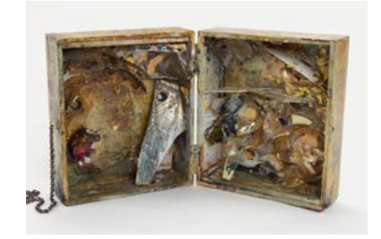
Controlled Burning: For Yvonne Rainer's Ordinary Dance, 1962 Wooden box, glass shards, mirrors, oil paint, burnt