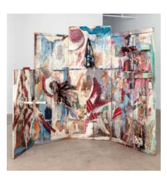
Four Fur Cutting Boards, 1963 Wooden boards, oil paint, lightbulbs, chain of colored light, plastic flowers, photographs, fabric, hubcap, tights, and motorized umbrellas The Museum of Modern Art, New York. Purchase, 2015