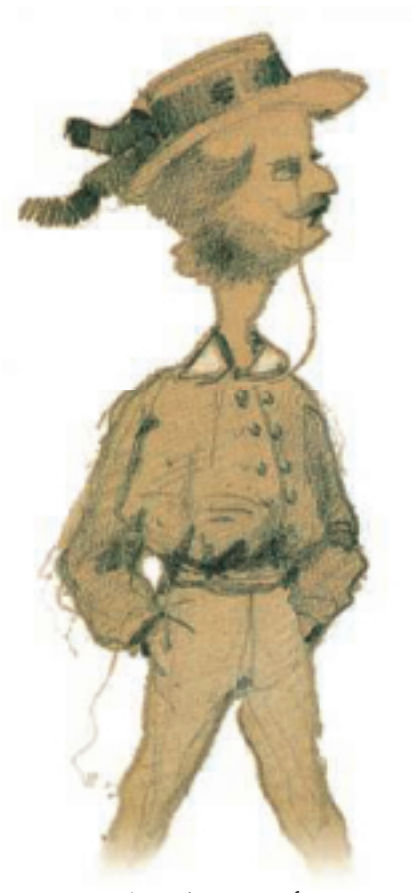
A caricature of a man in a straw hat