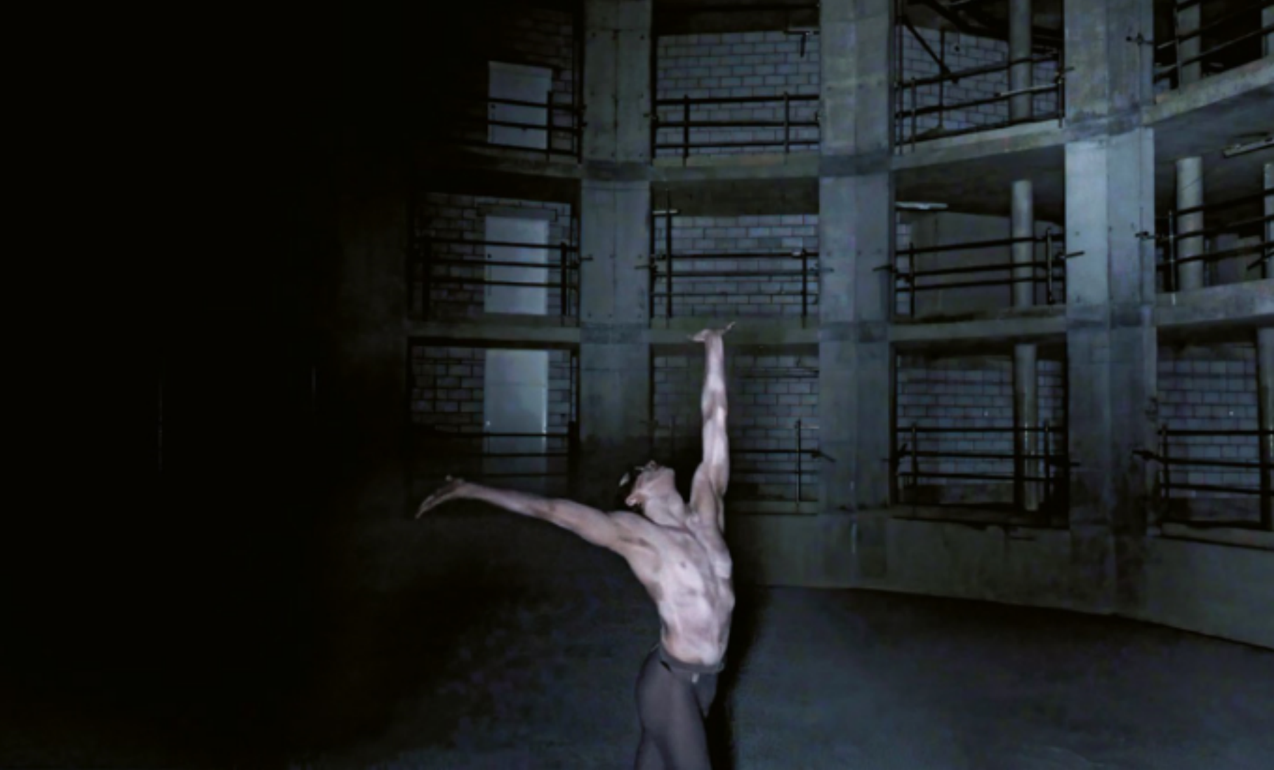
At the concrete bunker beneath Islington Green for Gareth Pugh and Nick Knight.