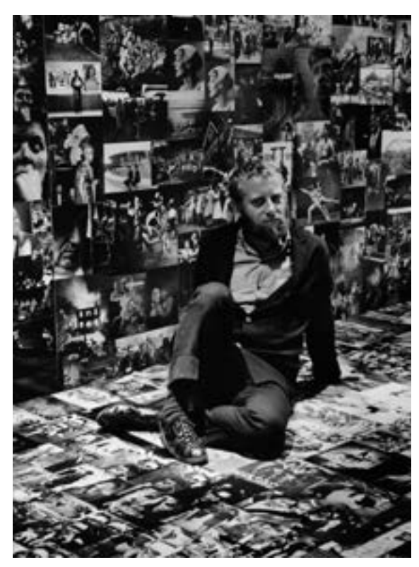
The entrance to the exhibition <u>Hee... zie je dat?</u>, Stedelijk Museum Amsterdam, 1966.

<u>Hee... zie je dat?</u> (Hey... Did You See That?), a solo exhibition by Ed van der Elsken, is held at the Stedelijk Museum Amsterdam from 8 September to 23 October. The exhibition is designed by