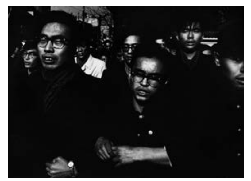
Zengakuren communist student demonstration, Tokyo, 1959

1960 Members of Zengakuren, a communist/ anarchist student organization, demonstrate in Japan in the early 1960s. They protest among other things against the American occupation of Vietnam. Van der Elsken photographs their demonstrations in Japan.