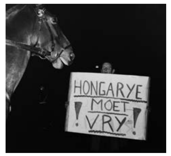
Demonstration against the Soviet invasion of Hungary, Amsterdam, 1956

The Hungarian uprising begins on 23 October. Soviet tanks roll into Budapest to suppress the protests. Van der Elsken photographs the Dutch protests against the Soviet invasion.