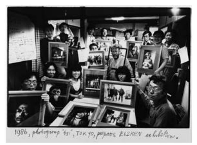
The 491 photo group preparing the <u>ELSKEN</u> exhibition, Tokyo, 1986

1985 <u>Elsken: Paris 1950–1954</u> is published by Libroport Co. Ltd of Tokyo.