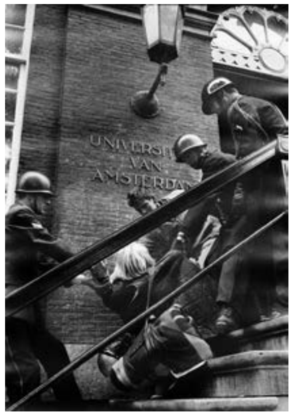
Occupation of Maagdenhuis ended, Amsterdam, 21 May 1969