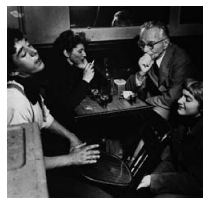
Edward Steichen and Ata Kandó, Paris, 1953

The Netherlands is hit by a severe storm on the night of 31 January. Van der Elsken is one of the photographers who takes pictures of the great flood of 1953 for the photobook <u>De ramp</u> (The Disaster), published by De Bezige Bij.