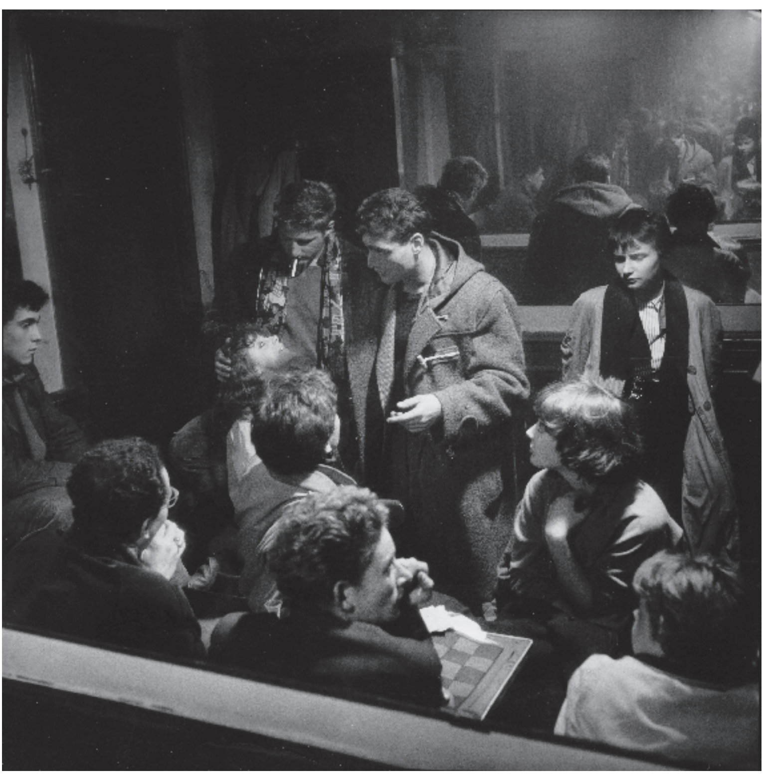
Chez Moineau, Rue du Four, Paris, 1953