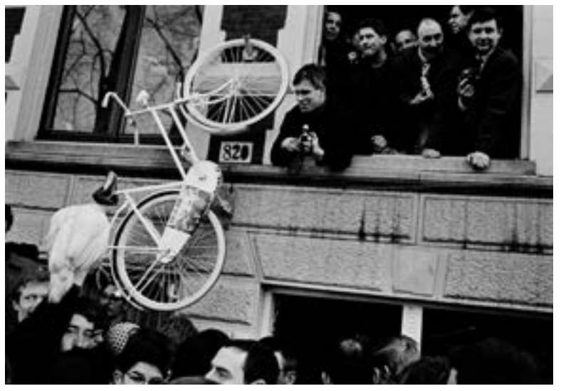
Provo demonstration against police action during the wedding of Princess Beatrix and Prince Claus, Prinsengracht, Amsterdam, 1966

hand to record the unrest in the city. In 1966, for example, he photographs the riots during the wedding of Princess Beatrix and Claus von Amsberg of Germany, and the construction workers' riots in the city centre. In 1969 he photographs the student occupation of the Maagdenhuis (the administrative centre of the University of Amsterdam). He also photographs Dolle Mina, an Amsterdambased group that campaigns for equal opportunities for men and women and the legalization of abortion in the Netherlands.