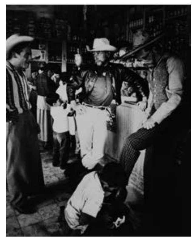
Ed in Mexico, 1960.

1959 Ed van der Elsken publishes Jazz, a photobook based on reportages made between 1955 and 1959 at large jazz concerts in the Netherlands, particularly the night-time concerts at Amsterdam's Concertgebouw.