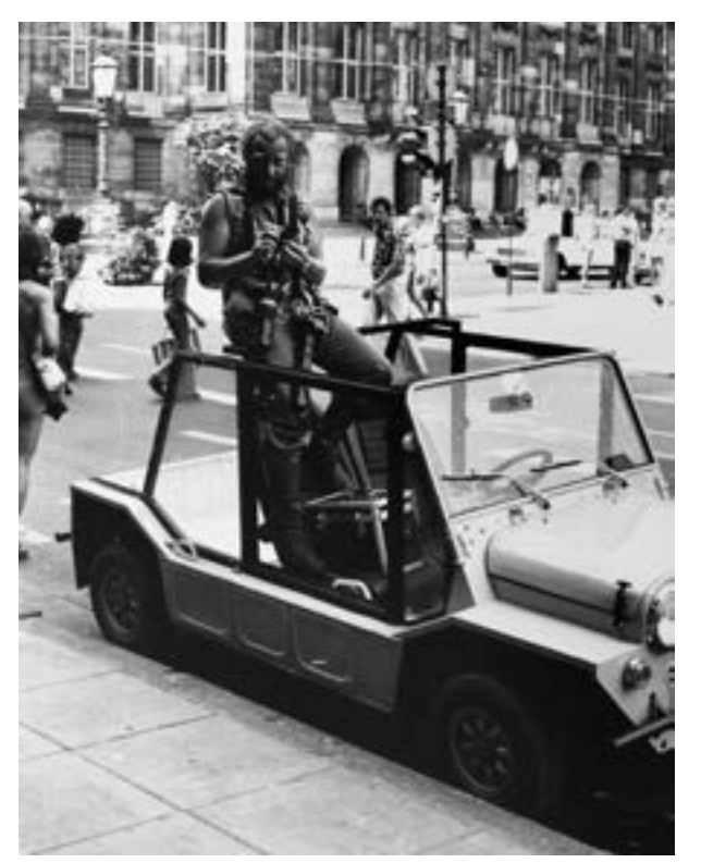
Ed van der Elsken in his Mini Moke, Amsterdam, 1977.

1982 <u>Een fotograaf filmt Amsterdam</u> (<u>My Amsterdam</u>, literally "A Photographer Films Amsterdam"; approx. 57 min., broadcast by VPRO on 29 June 1983) is a filmic portrait of Amsterdam and its residents.