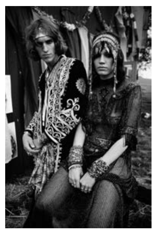
Hippies, Edam, c. 1969

1980 <u>Avonturen op het lan</u>d (Adventures in the Countryside). Van der Elsken makes both a film and a book, in colour and black and white, about his life in the countryside near Edam. The film is broadcast by VPRO on 30 March 1980.