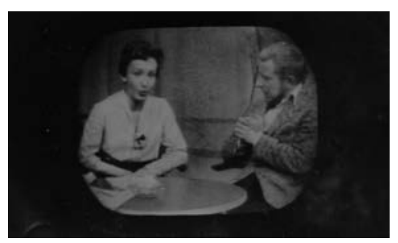
First television broadcast on <u>Love on the Left Bank</u>, 1 March 1955, Venster, AVRO

National television is launched in the Netherlands on 2 October 1951. Broadcasting company VARA transmits a programme about <u>Love on the Left Bank</u>.