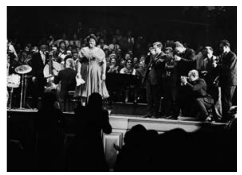
Ed van der Elsken at the Concertgebouw, Amsterdam, mid- to late 1950s.

The Stedelijk Museum Amsterdam starts a photography collection. In its first round of purchases, the museum acquires a selection of van der Elsken's photographs from Love on the Left Bank and the series on French Equatorial Africa.