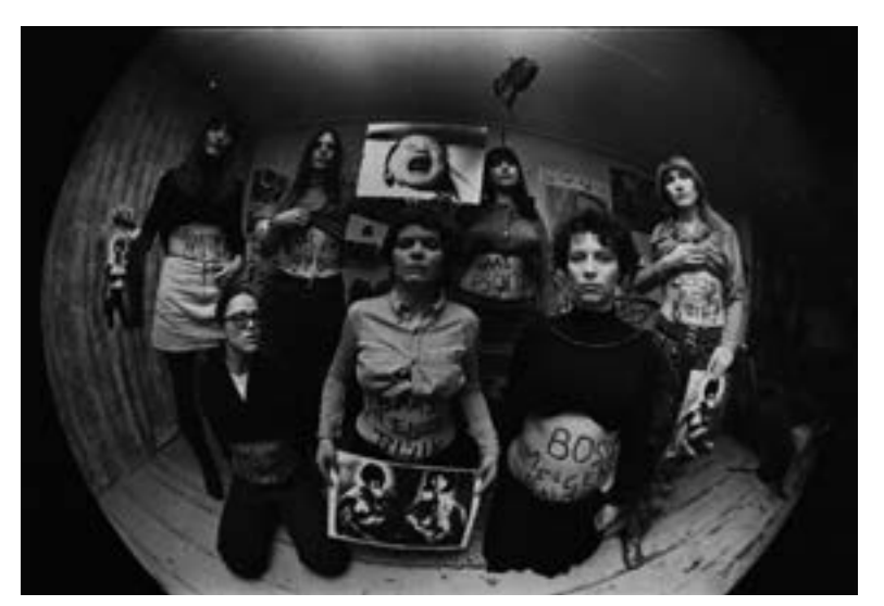
Activists of the Dolle Mina feminist group, Amsterdam, c. 1970