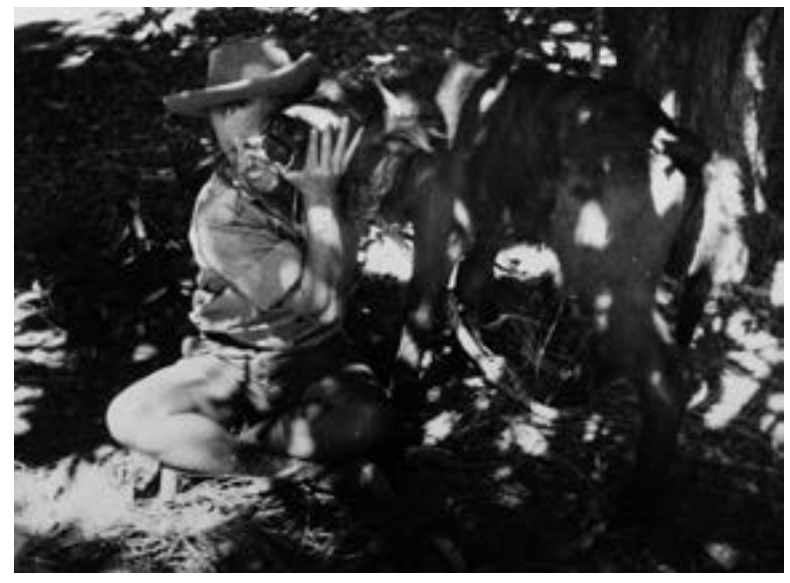
Ed in Oubangui-Chari, 1957

In December van der Elsken leaves for the Oubangui-Chari region, later Central Africa, on the border between Congo and French Equatorial Africa, to take photographs on commission for publishers De Bezige Bij.