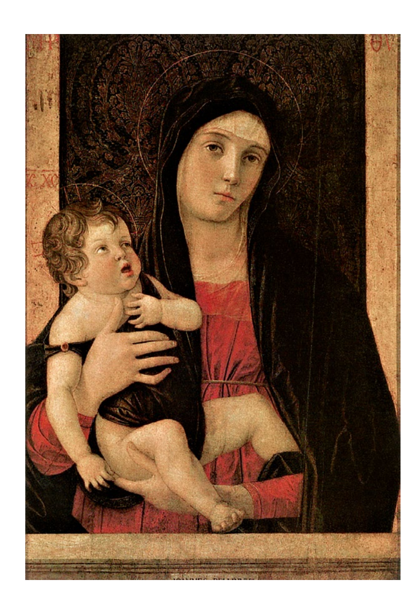
Giovanni Bellini, Madonna dell'Orto, c.1470–75, panel, 75×50 cm, Venice, Chiesa della Madonna dell'Orto (location unknown after theft in 1993)

OPPOSITE PAGE: FIG. 58 Giovanni Bellini, Lochis Madonna, c.1470–75, oil on panel, 47.4 × 33.8 cm, Bergamo, Accademia Carrara