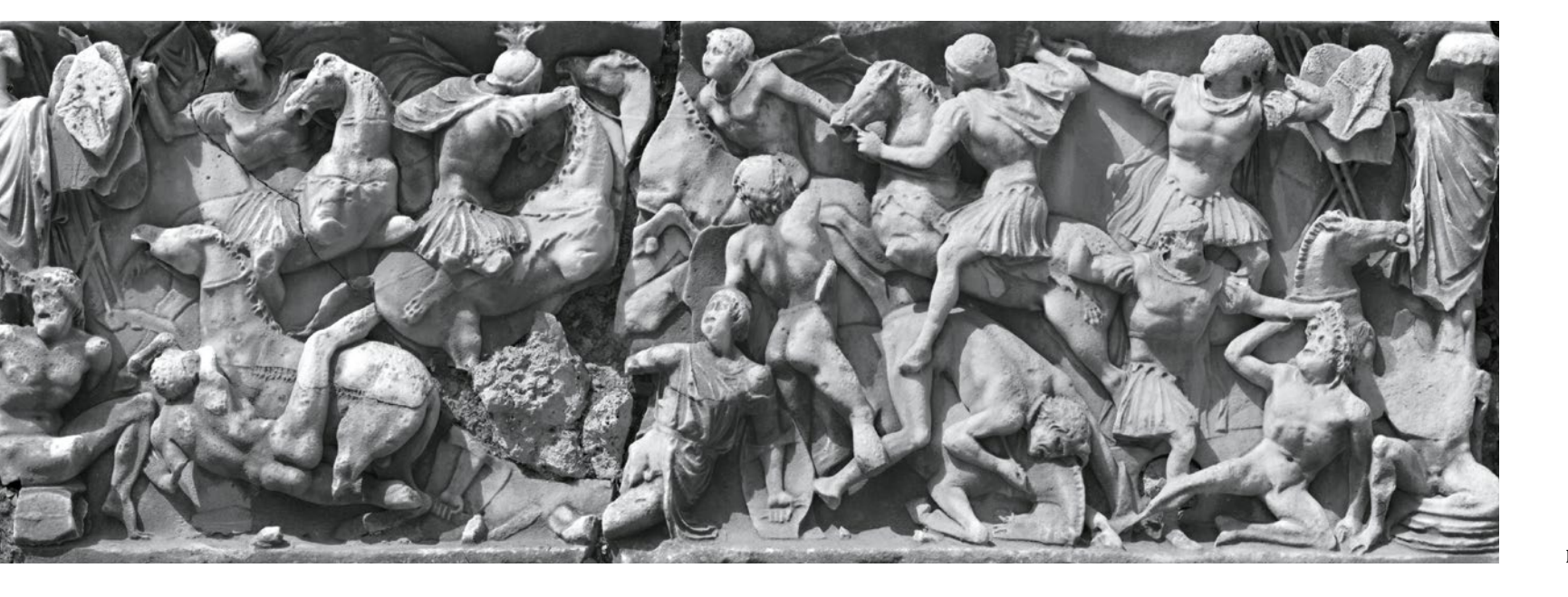
FIG. 56 Roman Battle Sarcophagus, 2nd century AD, marble, 86 × 152 cm, Rome, Villa Doria Pamphili

OPPOSITE PAGE: FIG. 58 Giovanni Bellini, Lochis Madonna, c.1470–75, oil on panel, 47.4 × 33.8 cm, Bergamo, Accademia Carrara