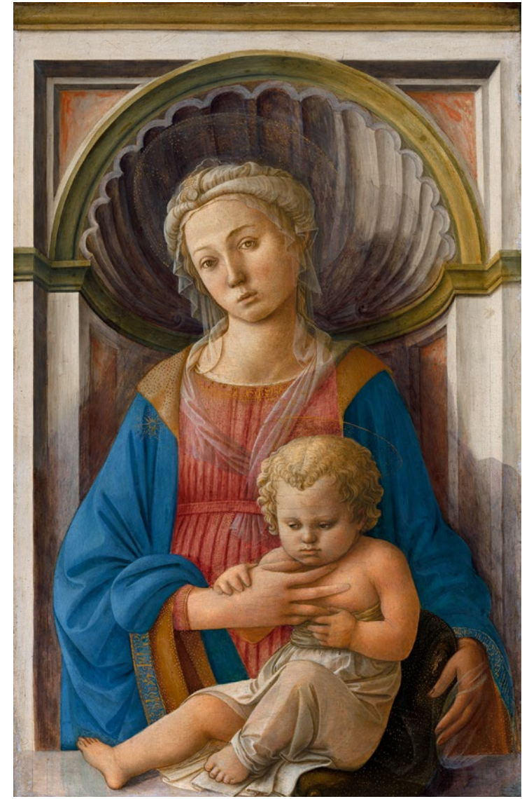
FIG. 45 Jacopo Bellini, Madonna and Child, c.1445–50, panel, 98 × 58 cm, Lovere, Galleria dell'Accademia Tadini

FIG. 46 Filippo Lippi, Madonna and Child, 1440s, panel, 79.1 × 51.1 cm, Washington, National Gallery of Art