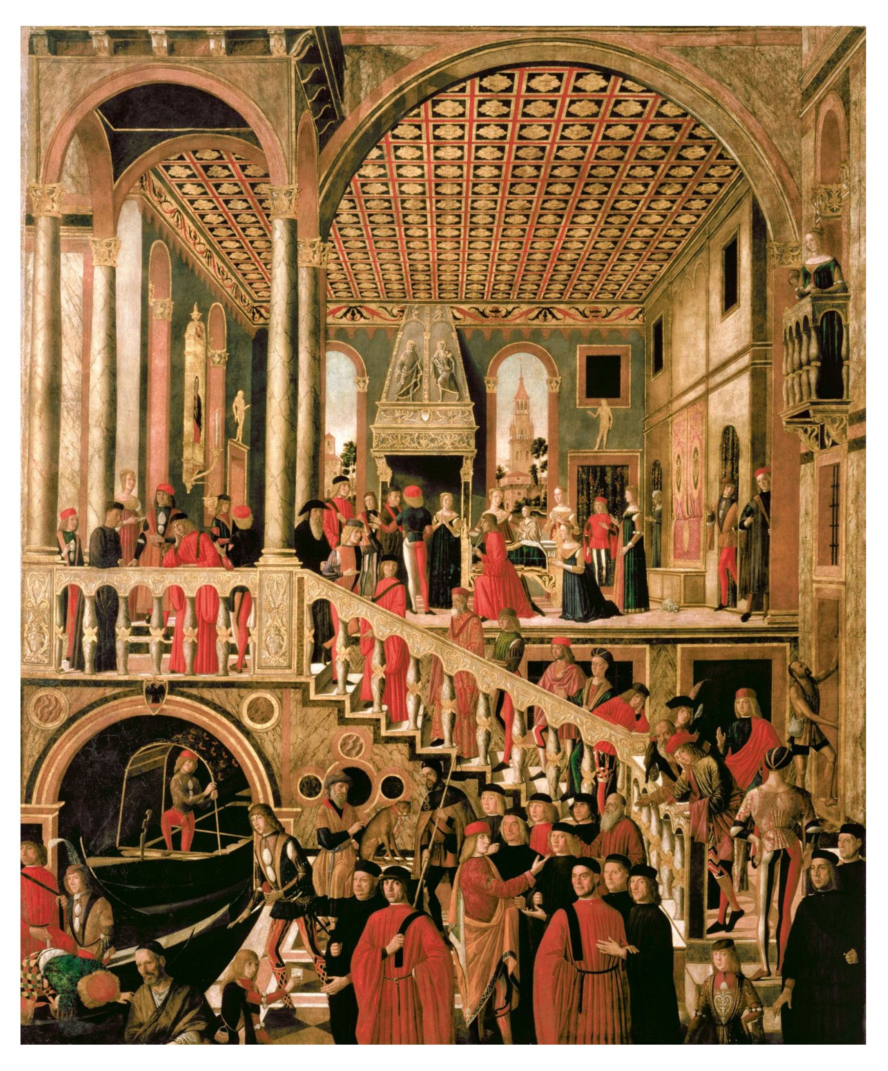
FIG. 54 Giovanni Mansueti, The Miraculous Healing of the Daughter of Ser Nicolò Benvegnudo of San Polo, c.1506, canvas, 369 × 296 cm, Venice, Gallerie dell'Accademia