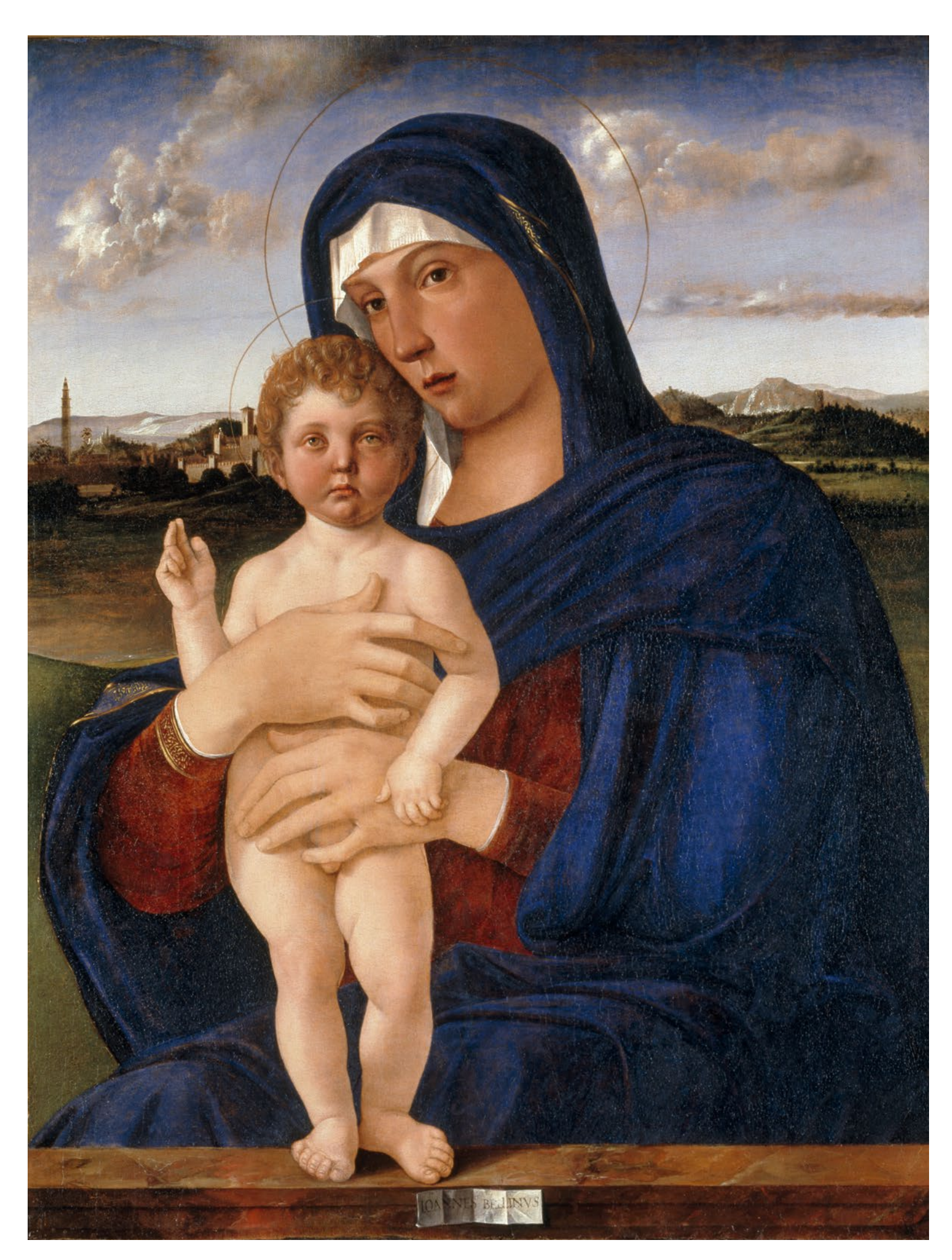
FIG. 53 Giovanni Bellini, Madonna and Blessing Child (Contarini Madonna), c.1480, panel, 60 × 78 cm, Venice, Gallerie dell'Accademia