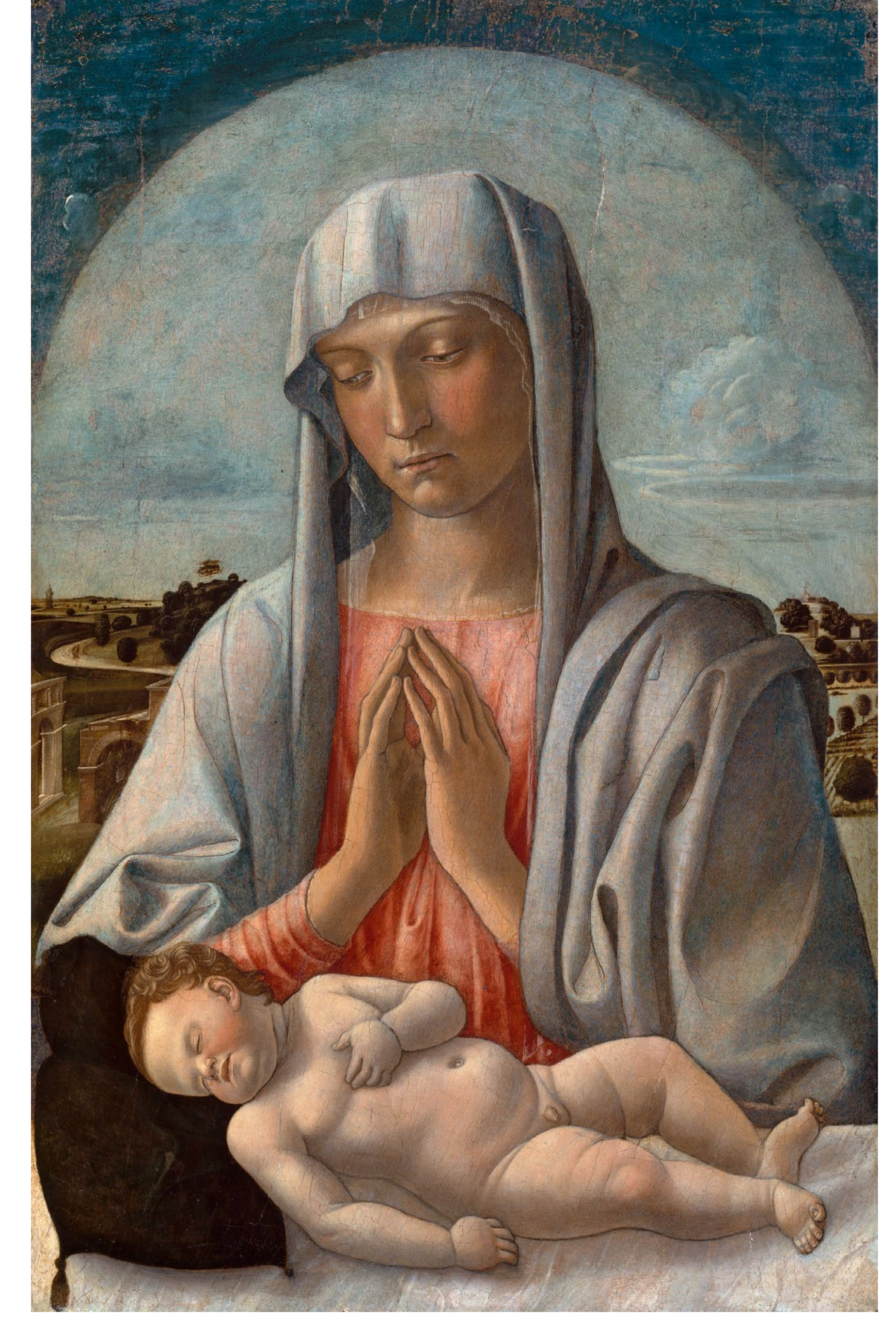
FIG. 47 Giovanni Bellini, Madonna Adoring the Sleeping Child (Davis Madonna), c.1460–65, panel, 72.4 × 46.4 cm, New York, Metropolitan Museum of Art