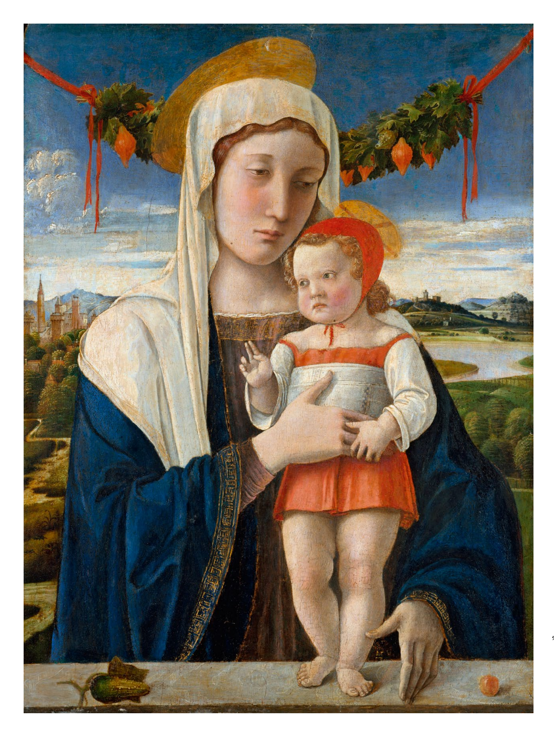
FIG. 48 Giovanni Bellini, Madonna and Child (Lehman Madonna), c.1465–70, panel, 53.9 × 39.9 cm, New York, Metropolitan Museum of Art