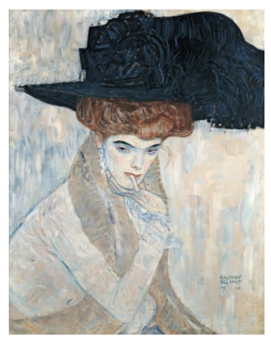
Gustav Klimt, The Black Feathered Hat, 1910, oil on canvas. Private Collection

There is no artist that more typifies the golden age of Viennese art than Klimt, and there is no work that captures the beauty of Viennese women better than the Portrait of Adele Bloch-Bauer I .