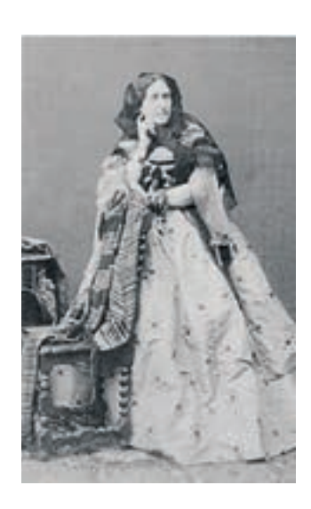
2. Josephine von Wertheimstein. Jewish Museum Vienna, inv. no. 13369