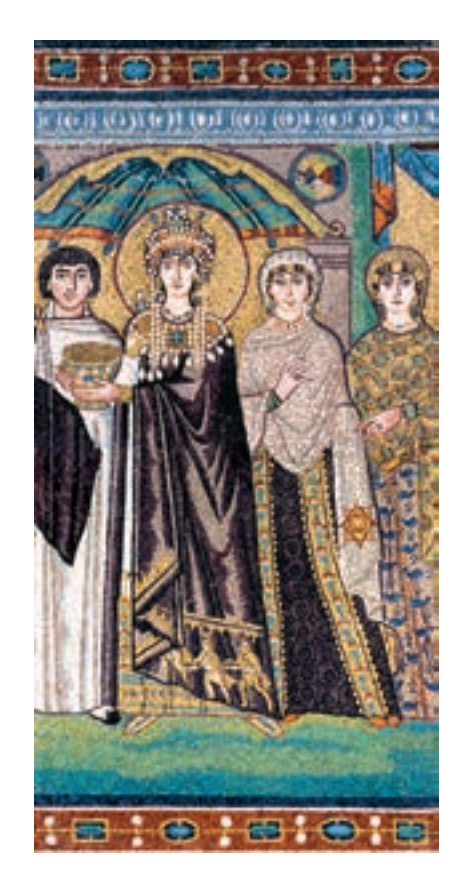
13. Copy of the mosaic of the Empress Theodora from the Basilica of San Vitale, Ravenna, mid-6th century. Execution: Gruppo Mosaicisti dell'Accademia di Belle Arti di Ravenna, 1951, glass, enamel, wood, metal. Ufficio Turismo e Attività Culturali. Comune di Ravenna

The theme of biological and cultural regeneration runs through many of Klimt's allegorical paintings of women, often set in opposition to the contrary forces of darkness and death. In Hope I [Fig.14] and Hope II, for example, Klimt breaks the taboo of depicting pregnant nudes, who are nevertheless haunted by spectral skulls that lurk in the surrounding space. Although Klimt is not typically presented as an artist interested in the social issues of his day, mother and child mortality ran high in turn-of-the-century Vienna, particularly among the disadvantaged lower classes (although class was not the only determining factor; Adele Bloch-Bauer, for example, lost two babies before 1905, and shortly before painting Hope / Klimt witnessed the death of his own son, Maria Zimmerman's baby, Otto). Although Klimt's allegorical style transposes