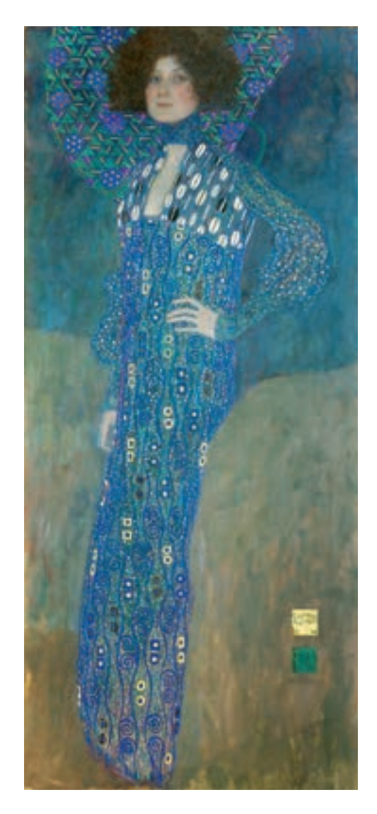
11. Gustav Klimt, Portrait of Emilie Flöge , 1902–03 (with later reworkings), oil on canvas. Wien Museum, Vienna

boundary between the two was not absolutely fixed—in a manner highly characteristic of the double moral standards of his age.<sup>47</sup>