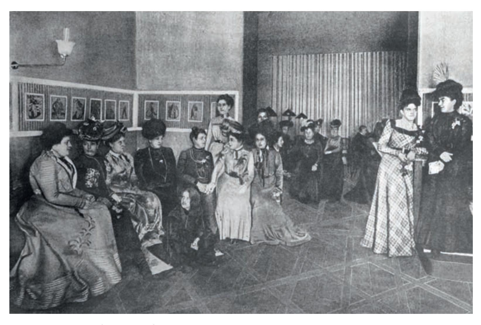
Interior view of the Wiener Frauenclub (Vienna Women's Club), designed by Adolf Loos, 1900. Photograph printed in the journal Das Interessante Blatt , Volume 22, November 1900. Austrian National Library, Vienna