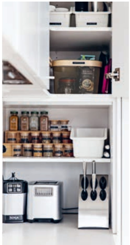
Marnie's cupboards are neat and tidy. There is always sufficient space for the essentials and everything is within easy reach.

Cabinets for cleaning utensils, bags and school books are stashed away under the stairs that lead to the children's room.