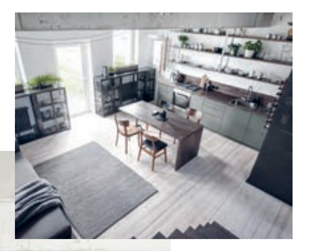
The concrete walls and ceilings were retained, and an expert took care of modern installations such as the lighting technology.

Industrial look: the designers had the welding work on the cupboards and shelves done by the car workshop around the corner.