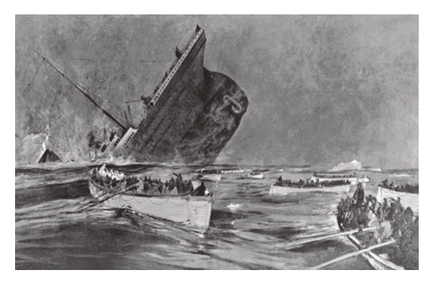
Sinking of the Titanic, 1912, gouache.

Historians are always ready to use photographs to illustrate historic events. They interpet them with the help of text sources, using them as secondary sources, if at all. Photos are considered supplementary information to the "hard facts," and are seldom interpreted as primary sources. When we take a closer look—as this book literally invites us to do—we find that photos occupy