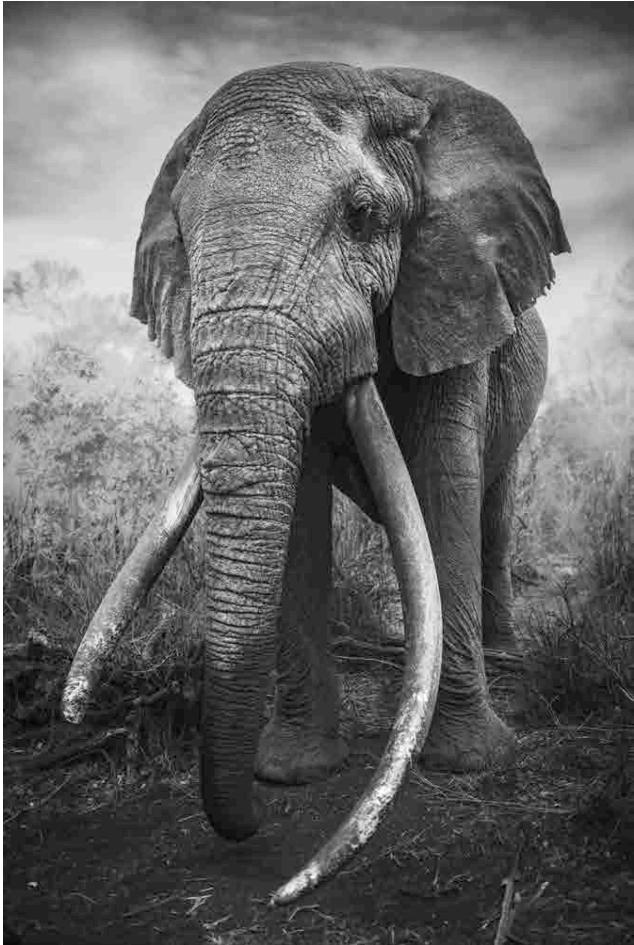
Oneton, Chyulu Hills, 2022