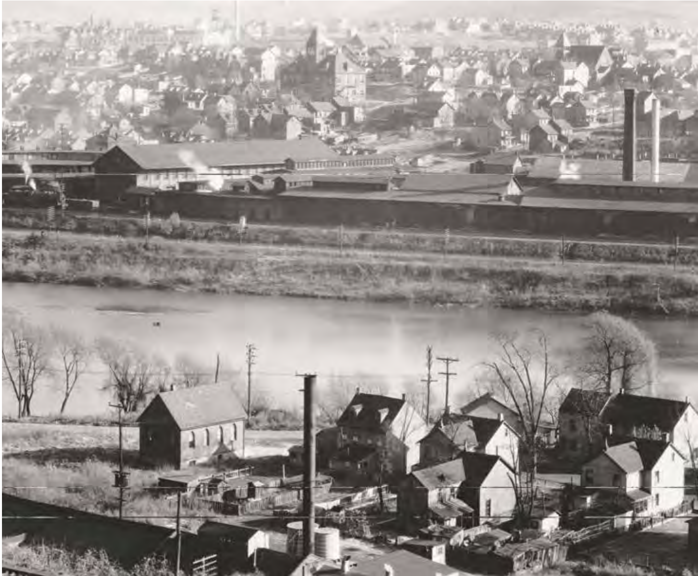
View of Easton, Pennsylvania, 1935