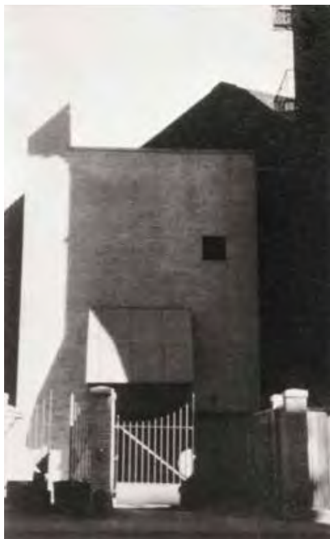
Untitled, Brooklyn House, 1929 Wall Street Windows, 1929