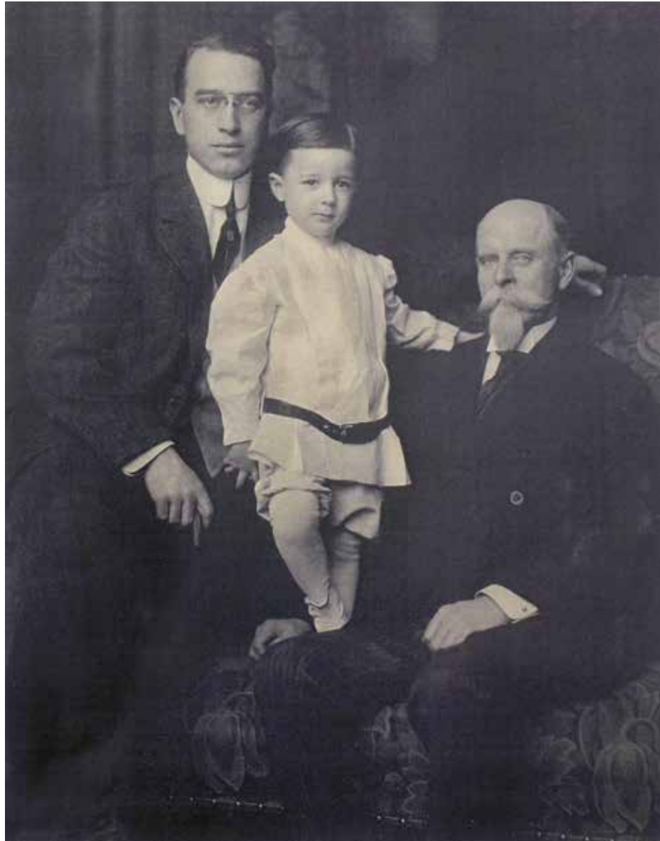
Walker Evans with His Father and Grandfather Walker Evans II, Walker Evans III, Walker Evans I