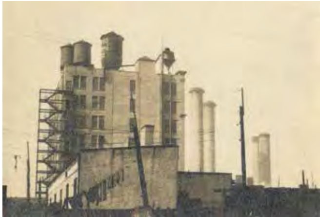
Walker Evans, Untitled, New York Skyline , ca. 1928