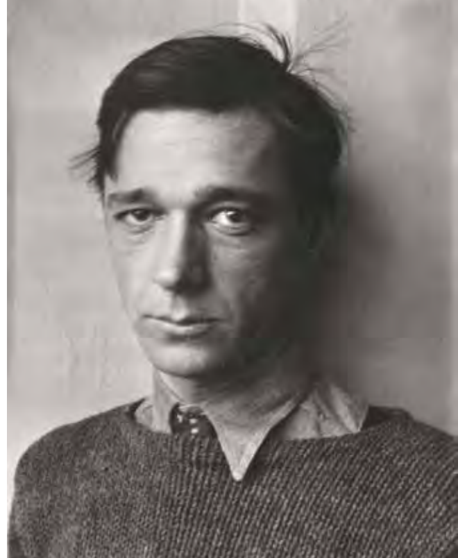
Untitled, Self-Portrait, Cuba, 1933