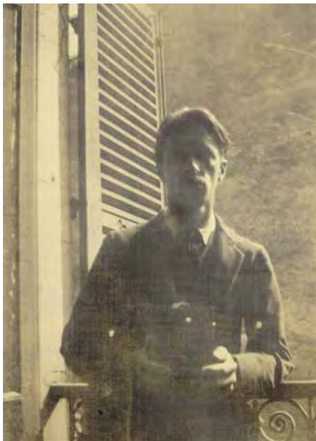
Untitled, Self-Portrait, Paris, 1926