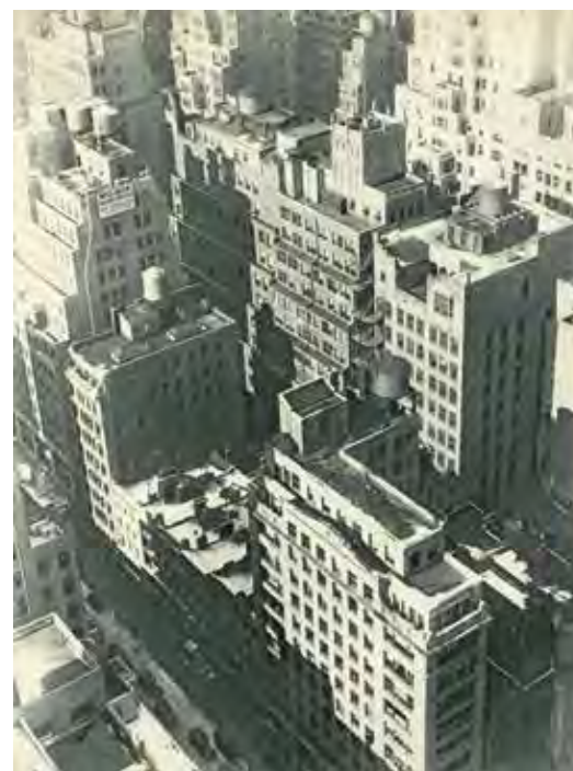
Walker Evans, plates 14 and 87, Die Sachlichkeit in der modernen Kunst