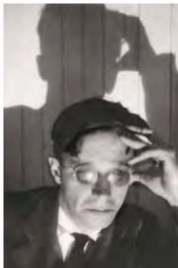
Untitled, Self-Portrait, Brooklyn, 1928