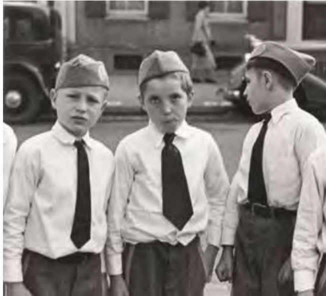
Sons of the American Legion, 1935