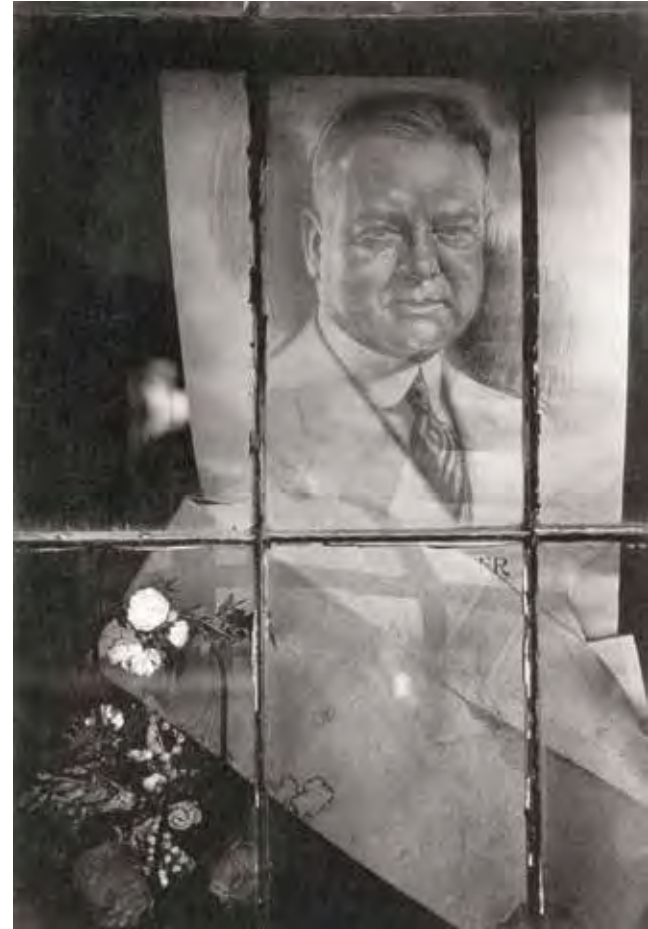
Political Poster, Massachusetts Village, 1929

Evans felt himself culturally and economically marginalized, and his rejection of American society and its values would later find expression in his preference for the joys and aesthetic tastes of the