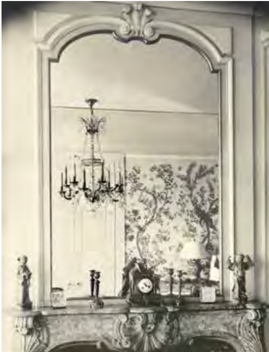
Walker Evans, Fuller House Interior , ca. 1930

a fortunate but natural conflation of Atget's work with the New Objectivity, we see Evans building the framework that would support a personal and intensely American style. Reviewing the Atget book, he noted a "lyrical understanding of the street,...special feeling for patina, eye for revealing detail, over all of which is thrown a poetry which is not 'the poetry of the street' or 'the poetry of Paris,' but the projection of Atget's person." What is not expected in a book review is Evans's criticism of the book's physical shortcomings: "reproductions are extremely disappointing. They and the typography and the binding make the book look like a pirated edition of some other publication." 8 These words signaled his early evaluation of the book as a complete gestalt, with a need to balance content and presentation.