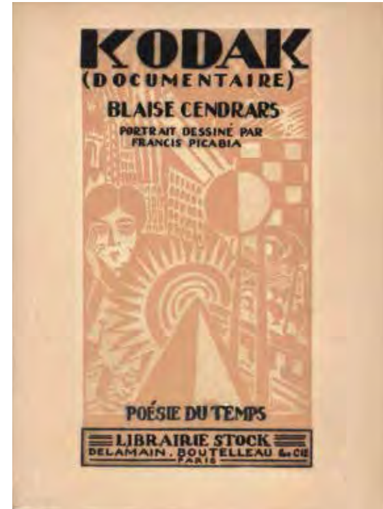
Blaise Cendrars, Kodak (Documentaire) , 1924