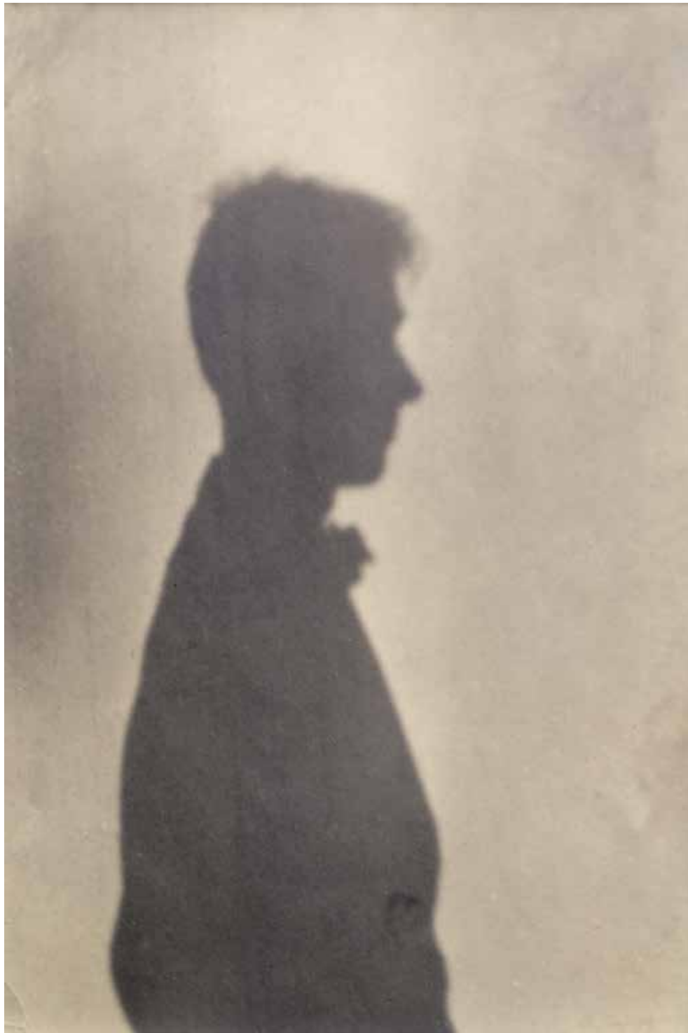
Silhouette Self-Portrait, Juan-les-Pins, France, January 1927