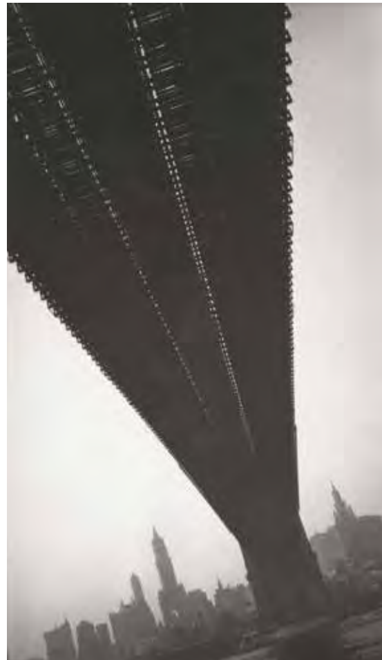
Untitled, Brooklyn Bridge, ca. 1929

"I was a passionate photographer, and for a while somewhat guiltily. I thought it was a substitute for something else—well, for writing, for one thing. I wanted to write. But I became very engaged with all the things there were to be had out of the camera, and became compulsive about it. It was a real drive. Particularly when the lighting was right, you couldn't keep me in. I was a little shamefaced about it, because most photography had about it a ludicrous, almost comic side, I thought. A 'photographer' was a figure held in great disdain. Later I used that defiantly. But then, I suppose, I thought photographing was a minor thing to be doing. And I guess I thought I ought to be writing. In Paris, I had been trying to write. But in writing I felt blocked—mostly by high standards. Writing's a