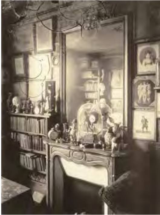
Eugène Atget, Petit Intérieur d'un artiste dramatique , ca. 1901