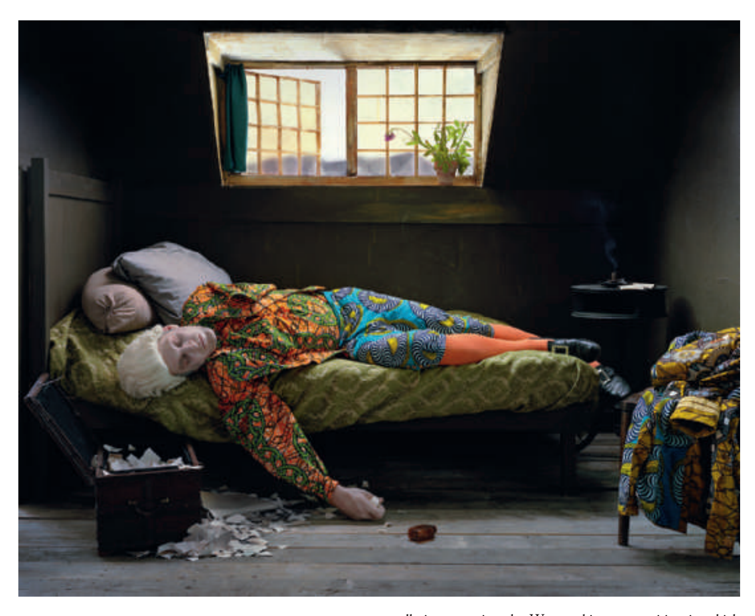
Fig. 12. Yinka Shonibare MBE, Fake Death Picture (The Death of Chatterton—Henry Wallis), 2011. Digital chromogenic print, ed. of 5; 194 x 148.9 cm (framed)

Odile and Odette is inspired by Tchaikovsky's ballet Swan Lake, which premiered in Moscow in 1877. In the ballet the princess Odette has been cursed by the evil sorcerer Von Rothbart to live as a swan by day and a woman by night. Von Rothbart disguises his daughter, Odile, to resemble Odette, except that she wears black instead of white, and Prince Siegfried mistakenly swears to marry her, leading to tragedy for Odette and Siegfried. In Tchaikovsky's ballet, the roles of Odile and Odette are traditionally performed by one ballerina with two costumes. Shonibare's interpretation extends the theme of blackness and whiteness in his juxtaposition of the two dancers, and