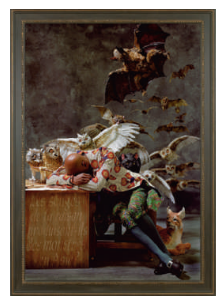
Fig. 13. Yinka Shonibare MBE, The Sleep of Reason Produces Monsters (Asia), 2008. Chromogenic print mounted on aluminum, ed. of 5; 207 x 147.3 cm (framed)

concerns that have shaped Shonibare's art since the mid-1990s, with their breaking down of grand narratives and contamination of ideas. In all five of them the specter of unreason hovers nearby, its presence a constant reminder that we humans are not perfect, rational, or enlightened all the time.