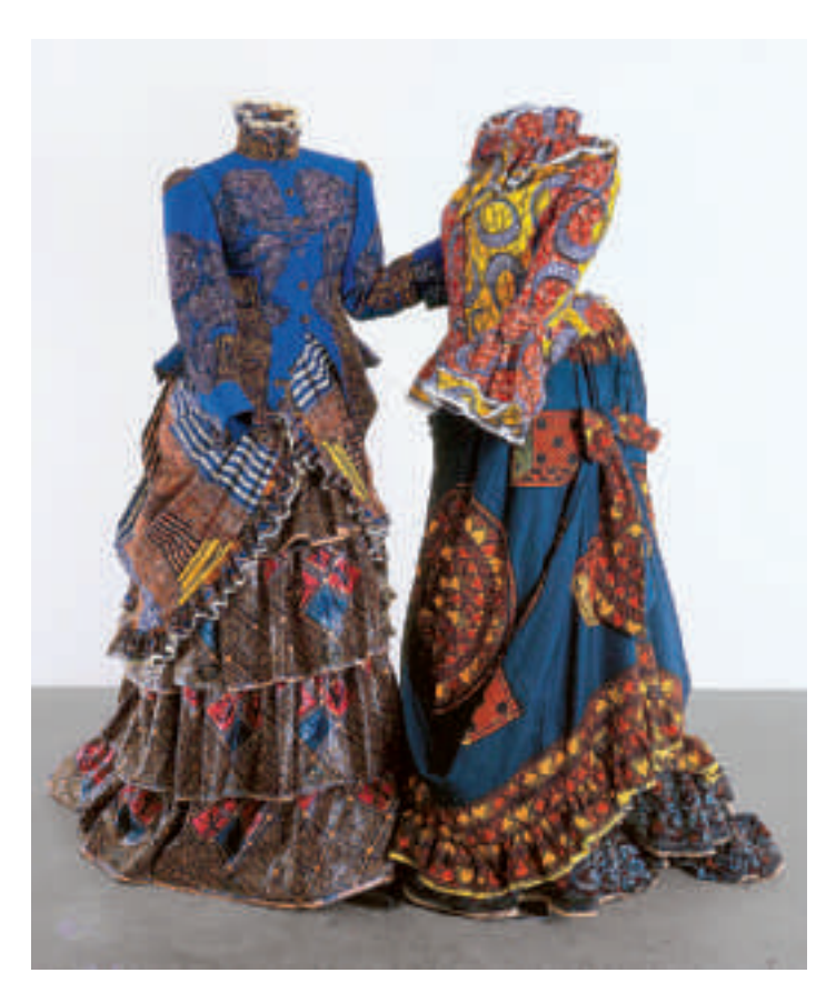
Fig. 10. Yinka Shonibare MBE, Gay Victorians, 1999. Two life-size mannequins, Dutch wax printed cotton, mixed media; 165.1 x 63.5 x 106.7 cm, 165.1 \times 73.7 \times 109.2 cm. Collection of Vicki and Kent Logan, fractional and promised gift to the San Francisco Museum of Modern Art

lampooned the rich and moralized to the poor through his art. He produced various didactic bodies of work first as paintings and then as prints, including The Harlot's Progress (1731); its sequel, The Rake's Progress (1734, fig. 11); Marriage à-la-mode (1743-45), with its ridiculing of upper-class vanities; and Beer Street and Gin Lane (1751). Shonibare's photographs resonate with The Rake's Progress, transposing the central character into the nineteenth century and following just one day in his life, unlike Hogarth's chronicle of Thomas Rakewell from his humble origins to success, dissipation, and eventual madness. Shonibare's work also avoids the moralizing tenor of Hogarth, celebrating excessiveness and decadence while inverting the stereotype of otherness through the figure of the black dandy, with his fawning white servants and acolytes. He says, "Rakewell spends his father's money extravagantly, gets into debt and ends up in a madhouse. My Diary of a Victorian Dandy is the opposite of that. My dandy has a wild time, has wild orgies, but he gets away with it. He challenges the notion of bourgeois morality."27 Shonibare's work