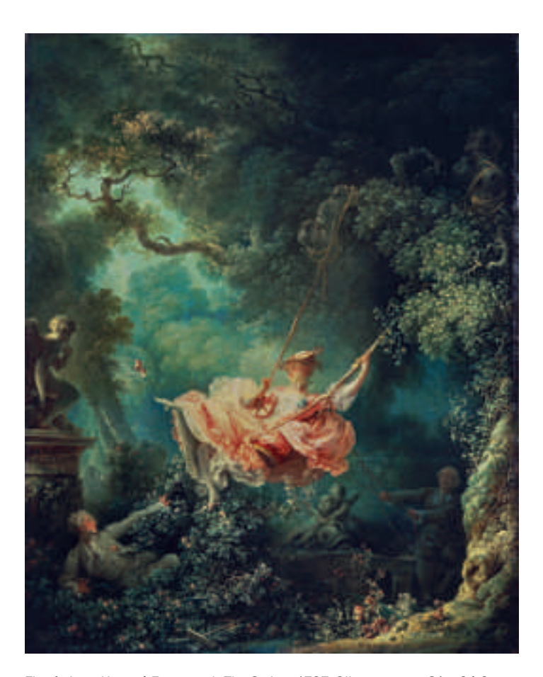
Fig. 4. Jean-Honoré Fragonard, The Swing , 1767. Oil on canvas, 81 \times 64.2 \text{ cm} . The Wallace Collection, London

scandalously, she is assisted in her tryst by a priest who obligingly pushes the swing. The concept of leisure is particularly significant for Shonibare. He observes: "To be in a position to engage in leisure pursuits, you need a few bob. . . . You need spare time and money buys you spare time. While the leisure pursuit might look frivolous . . . my depiction of it is a way of engaging with that power. It is actually an expression of something much more profoundly serious insofar as the accumulation of wealth and power that is personified in leisure was no doubt a product of exploiting other people."12 Shonibare's ice-skating cleric of 2005 (fig. 5, pp. 64-65, 150-51), meanwhile, draws upon Sir Henry Raeburn's painting Reverend Robert Walker Skating on Duddingston Loch (ca. 1795, fig. 6). Depicting an unexpected pastime for a reverend, who would normally be painted in a more pious or solemn moment, Raeburn's painting and Shonibare's sculptural response combine playfulness and seriousness while turning conventional expectations upside down. Interestingly, Raeburn and his painting are often spoken of within the context of the