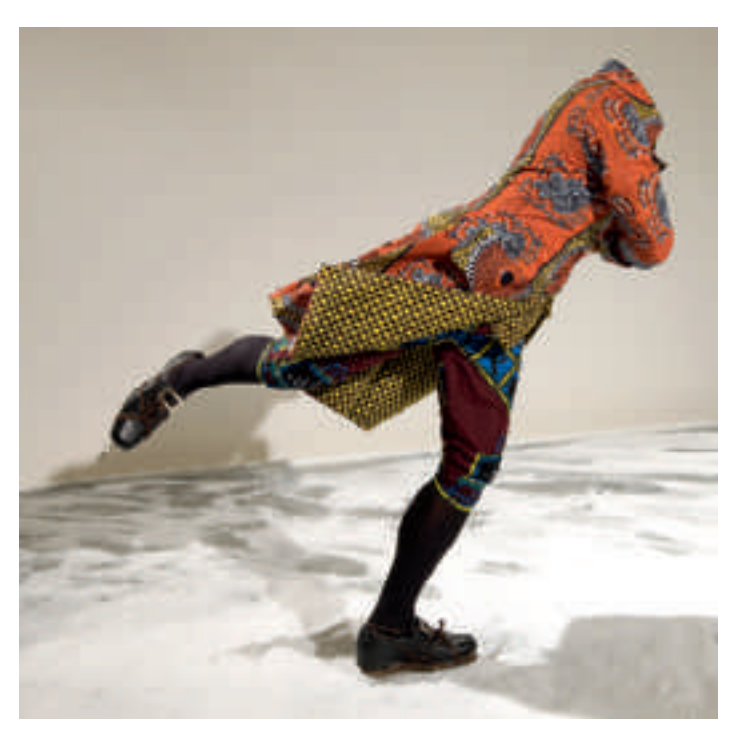
Fig. 5. Yinka Shonibare MBE, Reverend on Ice , 2005. Life-size mannequin, semi-opaque synthetic polymer resin, Dutch wax printed cotton, wool, leather, wood, steel; 160 x 402.3 x 601.5 cm. National Gallery of Victoria, Melbourne, purchased with the assistance of NGV Contemporary, 2006