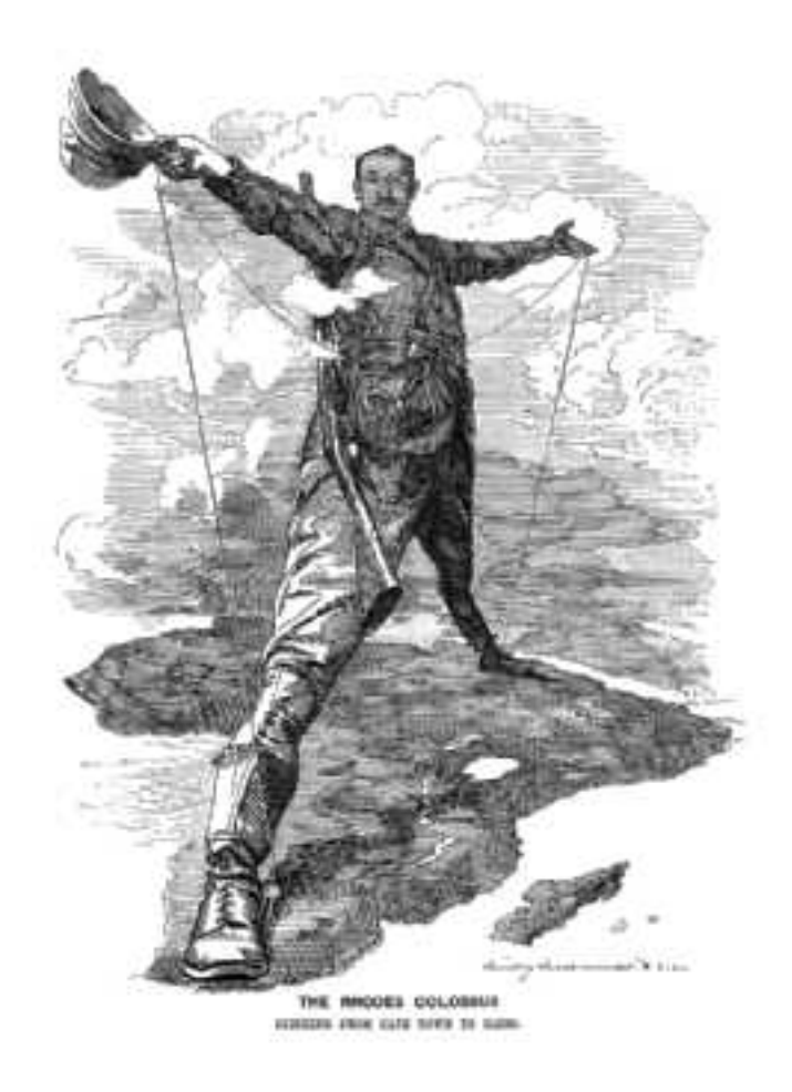
Fig. 8. "The Rhodes Colossus: Striding from Cape Town to Cairo," from Punch magazine, December 10, 1892

Shonibare's large installation The Victorian Philanthropist's Parlour (1996–97, pp. 181, 182–83) extends the theme of wealth and its creation in the nineteenth century. Designed like a stage set that viewers can walk around, its provisional wall panels and floor supports reveal an opulent interior setting and furniture upholstered with Dutch wax fabrics. In the context of the work, the absent philanthropist is a double-edged entity who has likely generated his wealth through the labor of others. His philanthropic redistribution presumably does not equal the vast sum of his worth, and the motives for his