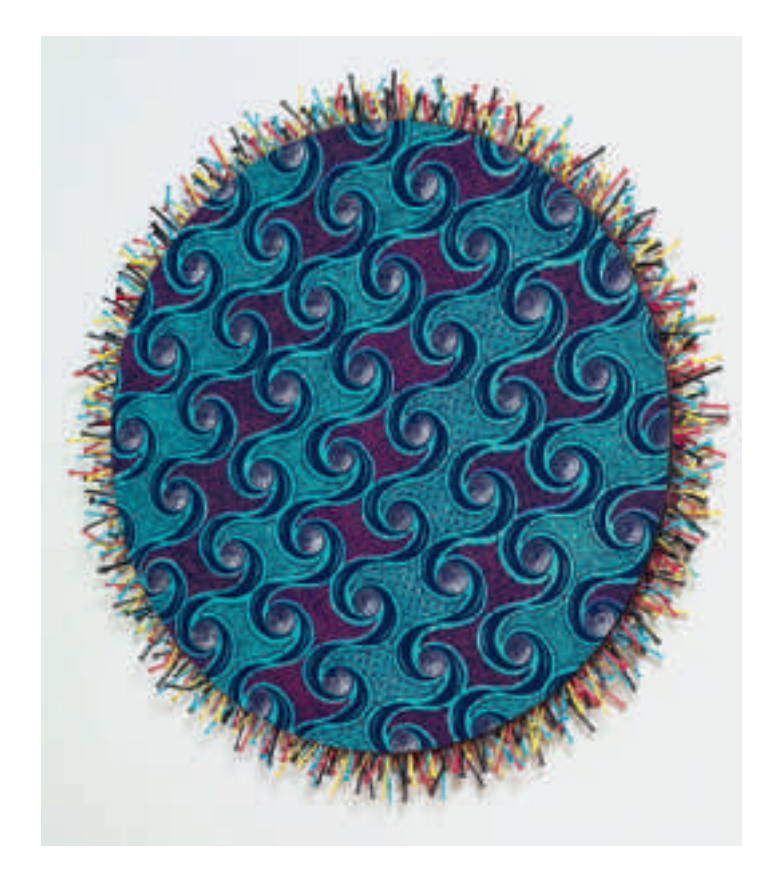
Fig. 1. Yinka Shonibare MBE, Circular Fetish Painting with Nails 2, 2012. Acrylic and acrylic aerosol spray paint on Dutch wax printed cotton, steel and aluminum nails, Medite MDF; 118 x 118 x 10 cm

Indeed, some of Shonibare's most recent paintings have moved off the gallery wall and onto the floor, taking the form of leaning panels or "totems," their edges surrounded by spiky, protruding nails. Recalling his first considerations of authenticity and stereotyping while at art school, and people's expectations in relation to "Africanness," the Totem Paintings (2011, p. 189) play with notions of the tribal in their menacing ornamentation. His series Circular Fetish Paintings with Nails (2012, fig. 1, p. 188) continues this exploration.