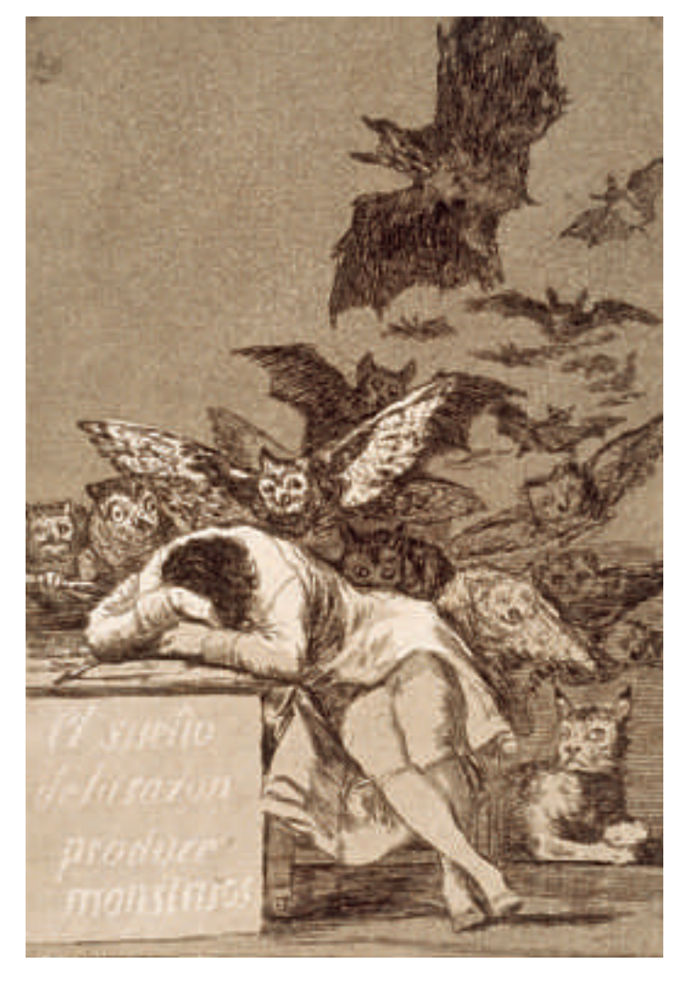
Fig. 14. Francisco de Goya, The Sleep of Reason Produces Monsters ( El sueño de la razón produce monstruos ), plate 43 from Los Caprichos ( The Caprices ), first edition, 1799. Etching and aquatint printed in sepia ink, 18.3 x 12.2 cm. National Gallery of Victoria, Melbourne, Felton Bequest, 1976

In his 1784 essay "An Answer to the Question: What Is Enlightenment?" the philosopher Kant cried, "Sapere aude! 'Have courage to use your own reason!'—that is the motto of enlightenment." Explaining that the individual must learn to think independently, "unfettered" by authority, he proposed that enlightenment "is the freedom to make public use of one's reason at every point." Shonibare draws a literary parallel between the Enlightenment ideal of reason (or "illumination") and its "dark" opposite through the presence of Caliban, Prospero's deformed slave in The Tempest . Introduced as "a freckled whelp... not honoured with a human shape," Caliban is the