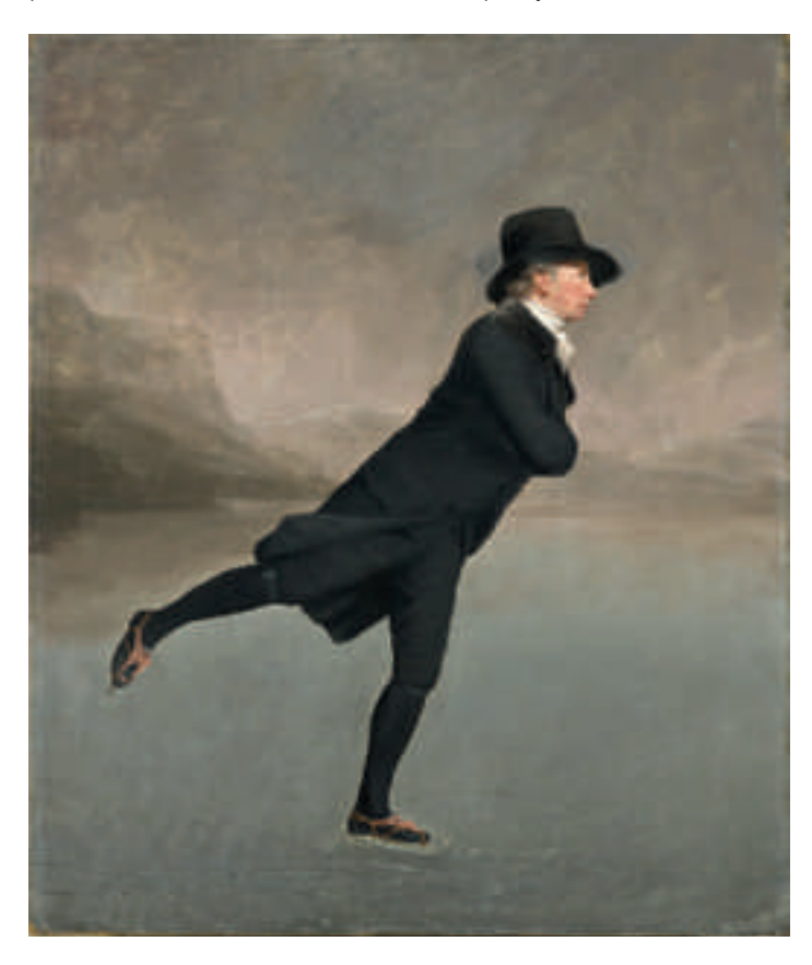
Fig. 6. Sir Henry Raeburn, Reverend Robert Walker Skating on Duddingston Loch , ca. 1795. Oil on canvas, 76.2 x 63.5 cm. Scottish National Gallery, purchased 1949

that the luxury they enjoy, the labour of making the clothes is supplied by others who are less fortunate."<sup>15</sup>