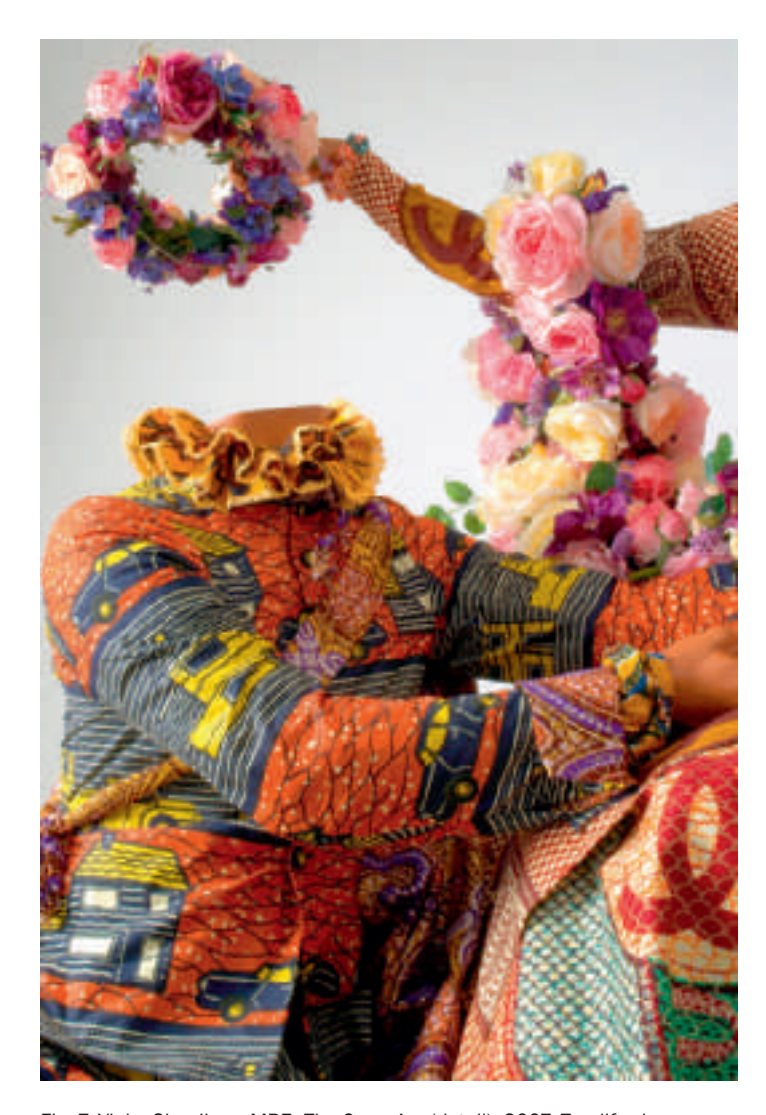
Fig. 7. Yinka Shonibare MBE, The Crowning (detail), 2007. Two life-size mannequins, Dutch wax printed cotton, shoes, coir matting, artificial silk flowers, mixed media; 160 \times 280 \times 210 cm. Commissioned by the Musée du quai Branly, Paris, for the exhibition Jardin d'Amour

While the eighteenth-century culture of excess has remained a persistent theme in Shonibare's art, the expansionist era heralded by the nineteenth century holds an equally strong appeal. Introducing his major book on the subject, the historian A. N. Wilson observed, "The Victorians are still with us."17 As a person living in England, surrounded by the vast architectural and technological legacy of the Victorian age, Shonibare has focused in considerable depth upon this defining period in the country's history. The cultural inheritance of the era-of "Victorian" morality, manners, social structures, and notions of class—has been particularly significant and forms a recurring theme within Shonibare's art. He says, "Living in England with my colonial relationship to this country one cannot escape all these Victorian things, because they are everywhere: in architecture, culture, attitude. ... In the eighties, Margaret Thatcher started talking about bringing back Victorian values, the time when everything was so proper-proper. And I started to think: what do these